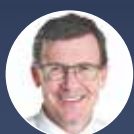
The Hon Alan Tudge MP Minister for Education