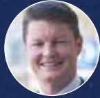
The Hon Ben Carroll MP Deputy Premier and Minister for Education