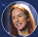
Kimberley Tempest Cobram Secondary College